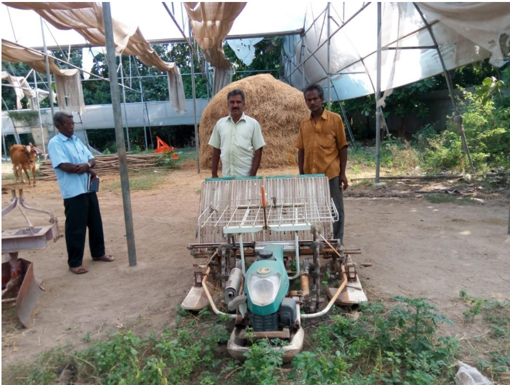
NEW TRANSPLANTER PURCHASED WITH THE PROFIT