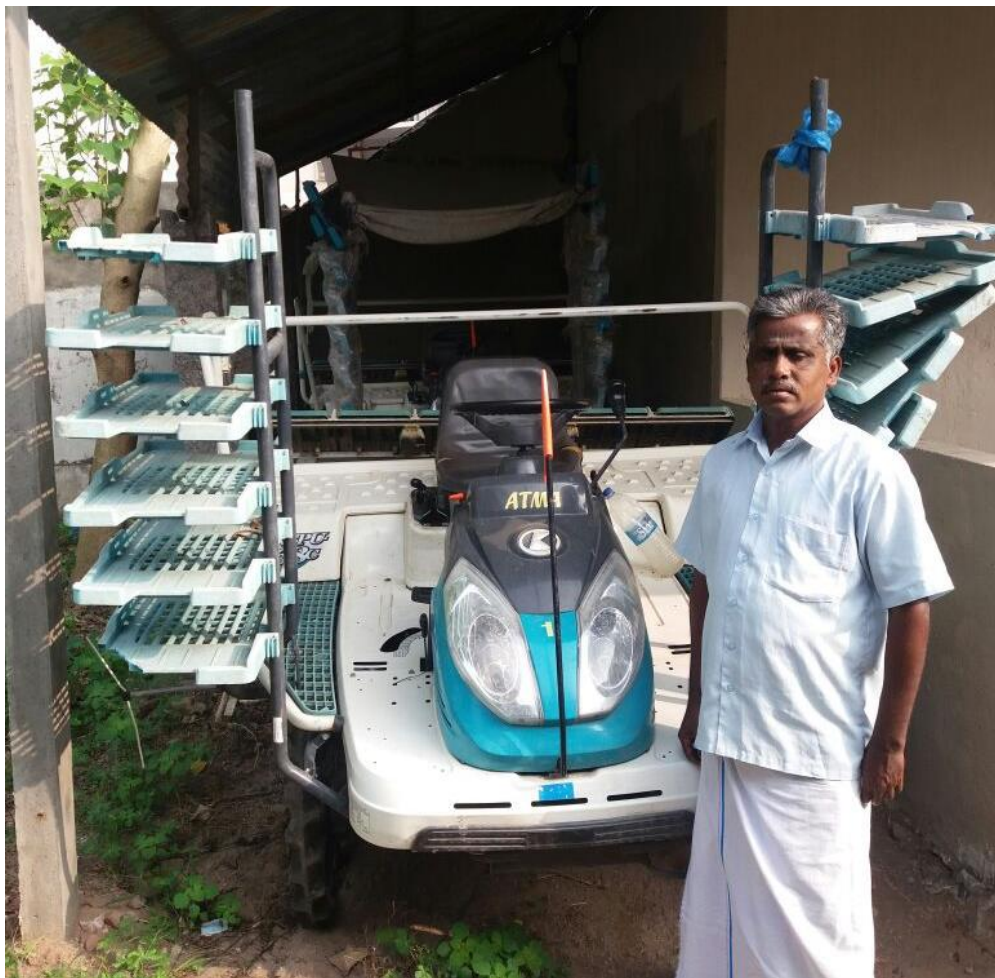
PRESIDENT OF THE CIG WITH PADDY TRANSPLANTER PURCHASED UNDER RKVY PROJECT