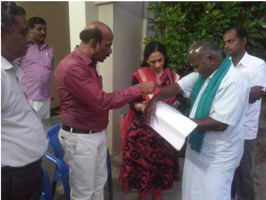
PROJECT DIRECTOR (ATMA) AND CIG PRESIDENT INTERACT WITH THE JOINT SECRETARY (RKVY), GOVT. OF INDIA, N. DELHI ABOUT THE FUNCTIONING OF CUSTOM HIRING CENTRE RUN BY THE CIG