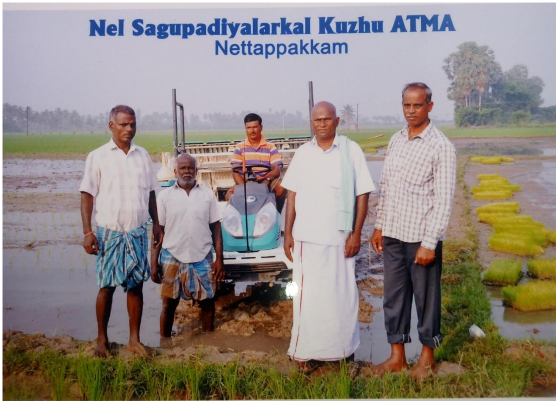
CIG PRESIDENT AND MEMBERS WITH PADDY TRANSPLANTER