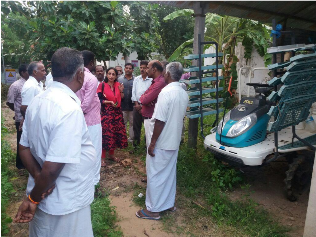
THE JOINT SECRETARY (RKVY), GOVT. OF INDIA, N. DELHI INSPECT THE CUSTOM HIRING CENTRE ESTABLISHED BY THE CIG AND INTERACT WITH CIG MEMBERS